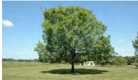
Lacebark Elm - Ulmus parvifolia