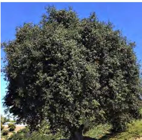
Holly Oak - Quercus ilex