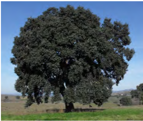
Cork Elk - Quercus suber