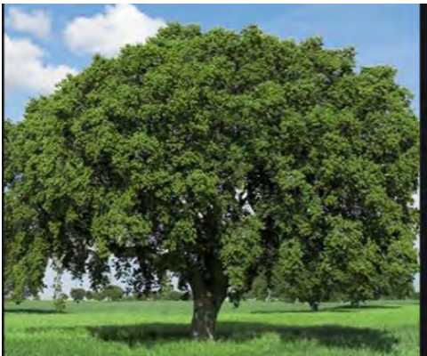
Southern Live Oak - Quercus virginiana